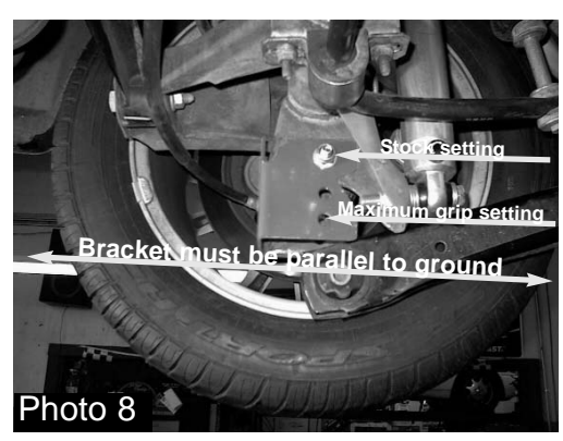
4. Confirm GMS LCA relocation bracket is parallel with the ground. This confirms axle alignment. -Tighten up bolt (see photo 8).

3. Slide the GMS LCA relocation bracket into place. V-shape goes up. The top holes of the bracket should line up with the factory location holes. Using the supplied grade 8 bolt, first slide it through the remaining portion of parking brake cable bracket and then through the GMS LCA relocation bracket. DO NOT TIGHTEN THE BOLT YET (see photo 7).