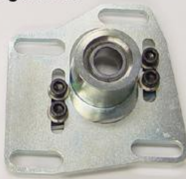
Caster Camber Plate w/Bearing Retainer