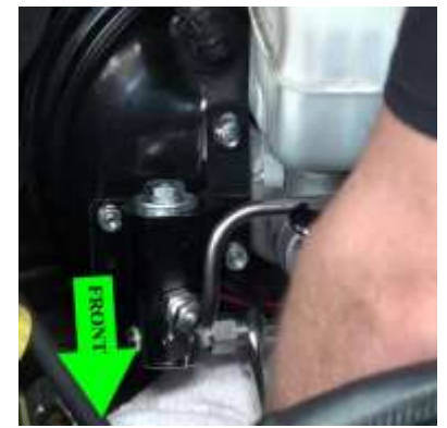
Step 9 Photo