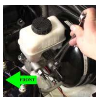
Step 8 Photo