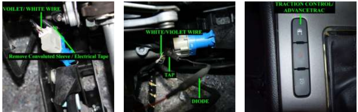
Step 16 Photo

Caution: It is important that you do not allow the brake pedal itself to travel while removing and/or re installing the brake pedal switch