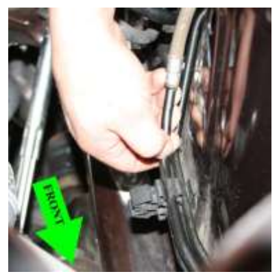
Step 7 Photo

STEP 8. Before removing the factory brake line from the rear body of the Master Cylinder, place clean rags underneath to catch residual leakage. Fluid that may spill onto the vehicle needs to be cleaned and removed immediately. Now, using a 15mm wrench , you may unscrew front brake line shown in figure 8.