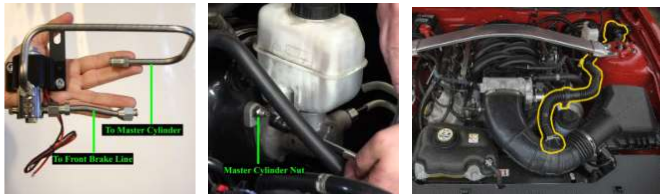
Step 4 Photo

NOTE: Always use Teflon® tape to ensure a leak-proof seal. The use of thread sealer paste is ordinarily not recommended because it contaminates the brake fluid. Ensure the solenoid body does not loosen while tightening adapters and plugs. It is important to make sure the ports are correctly aligned and positioned before using a 9/16"socket to re-tighten top solenoid nut.