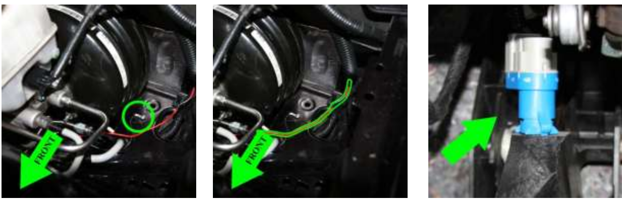
Step 13 Photo